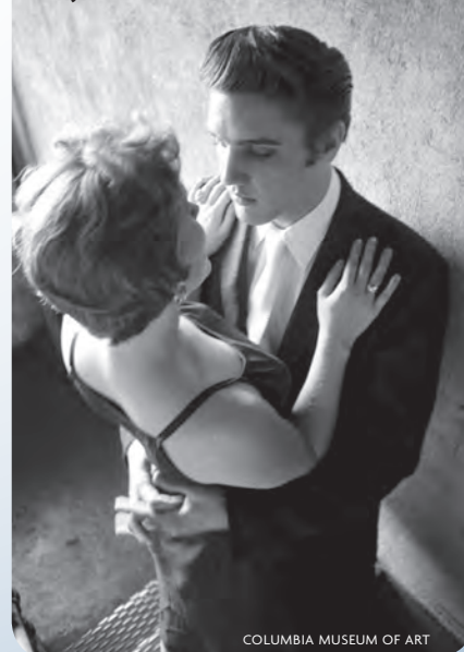
COLUMBIA MUSEUM OF ART