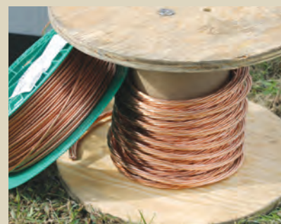
Each month, Marlboro Electric is finding copper stolen from their infrastructure and the cost has grown to more than $100,000 in replacement costs, materials, labor, time, etc. Copper theft is costing the members!