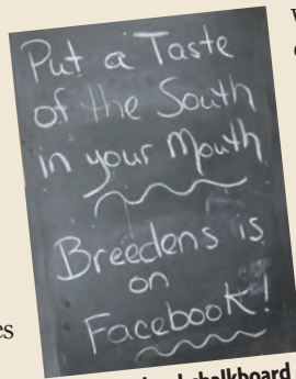
This old school chalkboard emphasizes tradition with a modern-day twist.

Breeden's Grocery is known for its great-tasting sausage that can be cooked with a variety of vegetables and side dishes, or for the more southern style of eating, just throw a piece of sausage between two slices of bread, and it's ready!