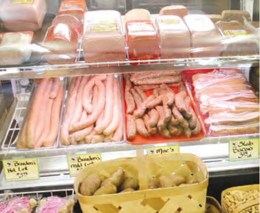
A variety of meats are showcased at Breeden's Grocery as in 1926.

The delicious sausage from Breeden's has been the 'link' to becoming a "Certified SC Product." The Certified South Carolina program is a cooperative effort among producers, processors, wholesalers, retailers and the South Carolina